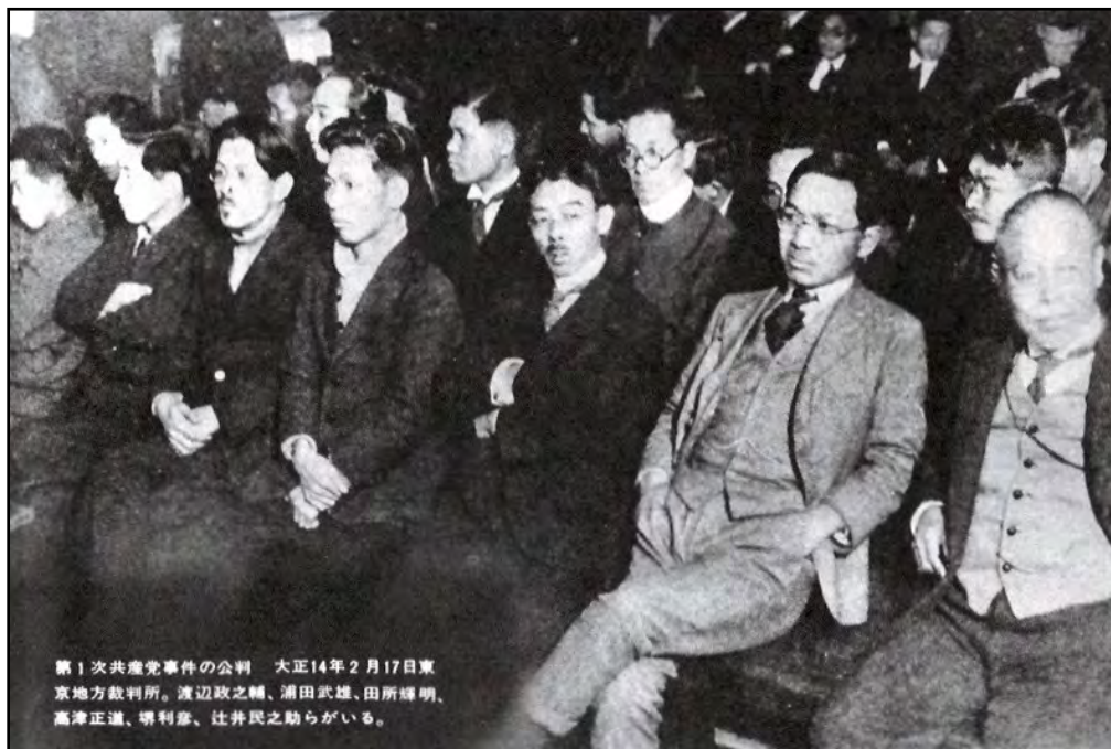
Figure 2. The early JCP on trial, February 17, 1925.

Japanese socialists, forcing them to reconsider the readiness of the Japanese proletariat for an internationalist socialist revolution. Adding to the shock were the murders of a number of known leftists, including the anarchist Ōsugi Sakae, by the military police. At a meeting on October 22, 1923, the remaining members of the JCP, demoralized by the arrests, murders, and general devastation of the city, decided to disband the party. In March 1924, members of the JCP who managed to escape to Vladivostok and Shanghai established the foreign bureau of the Japanese Communist party in Vladivostok, which acted as an intermediary between Moscow and the remaining Communists in Japan. 11