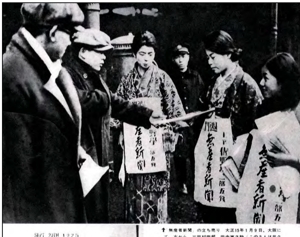
Figure 5. Women distributing the Communist newspaper Musansha shinbun on the streets of Osaka, January 9, 1926.

Farmer Party), and Rōdō nōmin tō (the Worker-Farmer Party). All three parties had ties to the illegal JCP. The league organized a commission to investigate Japanese military actions in China. Its twelve members were, however, arrested in Fukuoka en route to Shanghai in August 1927.