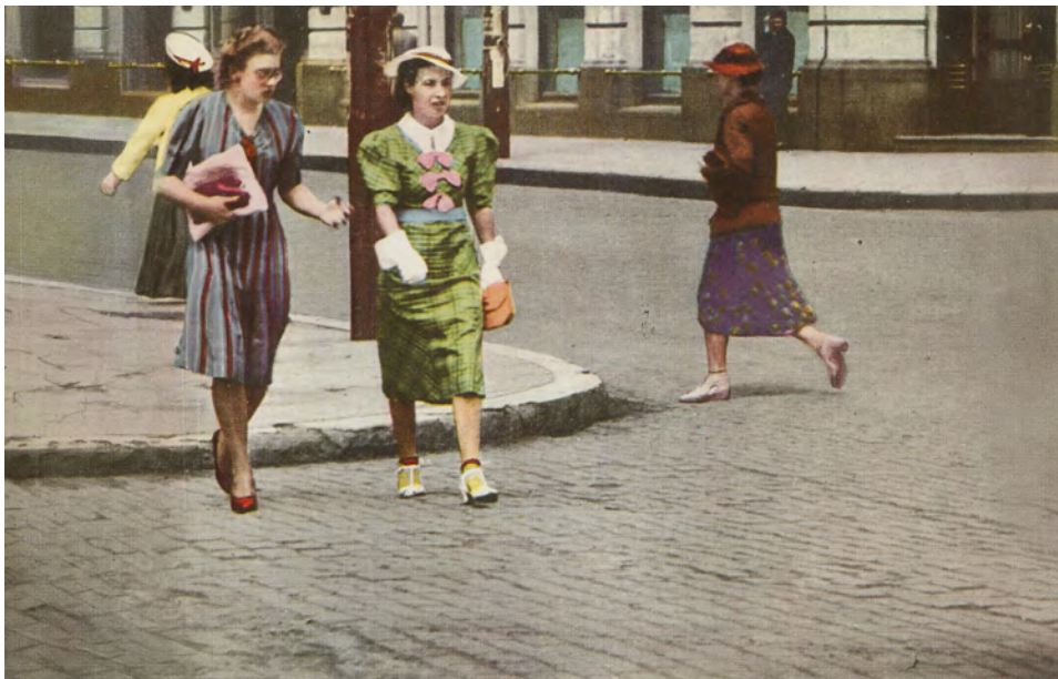
Figure 3. Slavic emigrant women in Harbin, Manchuria, 1932.

The prominence of Russian characters in Northeastern fiction has been noted not only for the frequency of their appearance, since Russian emigrants were a common sight in many Chinese cities, such as Shanghai and Tianjin, but also for their integration into the Chinese family, as in the case of Luo Binji’s “Fellow Villager: Kang Tiangang.” The seamless coding of their offspring as unproblematically Chinese also suggests that Russian women, often stateless wanderers, were being assimilated into the Chinese nation-state. Xiao Hong’s fiction runs counter to the assimilating logic of other Northeastern writers by discussing the Russian Harbinites ( Kharbintsy )—such as the Slavic emigrant women pictured in figure 3—as a separate community in Harbin, living on their own terms and involved in their own struggle to determine their place in relation to Russia and China. 10