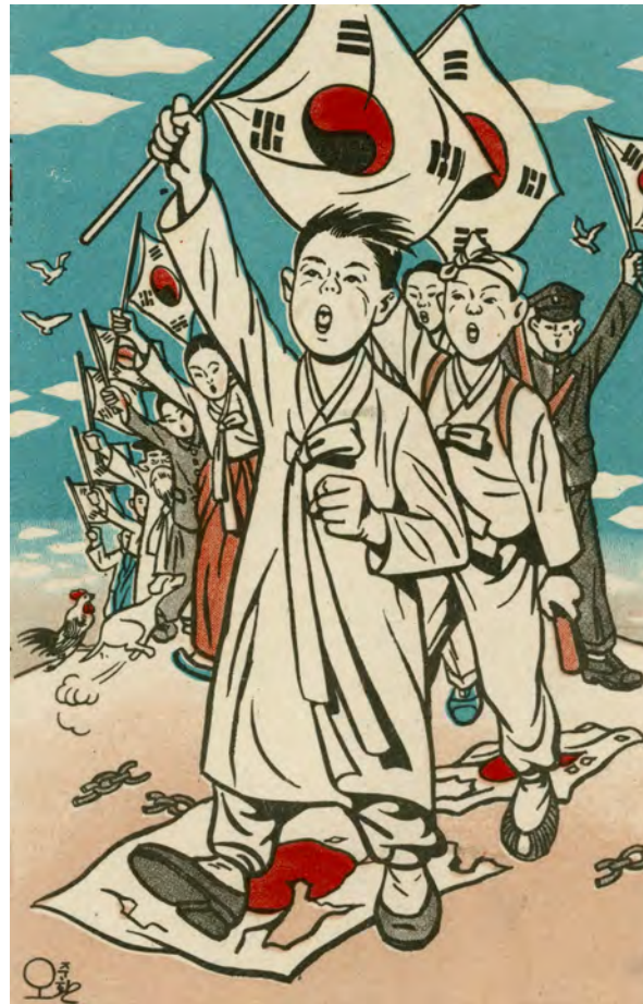
Figure 4. Liberation of Korea, 1945.

The short anecdote hinges on another unanswered question. At one point in the middle of the story, the narrator innocently asks Yali where her hometown is. She does not answer but only cries. In contrast to “Sophia’s Distress,” in “Yali,” it is the narrator who asks an unanswerable question only to receive an inadequate response. The answer is revealed only at the very end of the story when Yali writes a letter to the narrator revealing that she is from Korea and that her mother still lives there. Her father was forced to marry her stepmother and was exiled to Manchuria. Since her stepmother has now reported her father to the police for being a dissident, Yali has decided to return to Korea and sacrifice her life for her country.