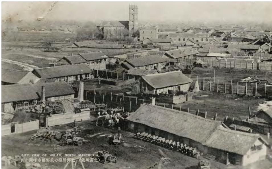
Figure 1. Postcard of Hulan, Manchuria, 1932.

Hong died a refugee, at the end of a long and wandering journey. This rootless existence was one of the circumstances that first brought her to political fame.